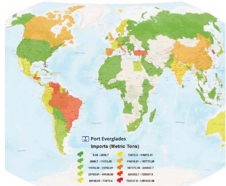
Port Everglades Import Commodity Flows, 2013