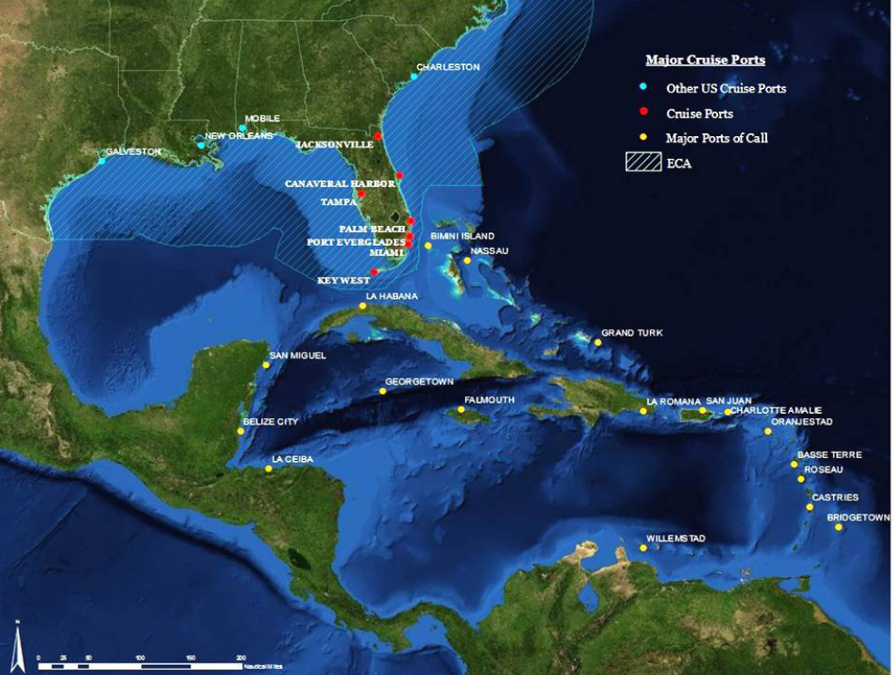
* Note: As of January 1, 2014, the US Caribbean Sea ECA emcompassing the jurisdictional waters 50 nautical miles out from Puerto Rico and U.S. Virgin Islands, will take effect.