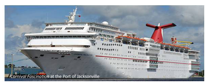
Florida's Cruise Industry Statewide Perspective Florida Department of Transportation Page 3

Once opened to normalized relations, Cuba is likely to offer new opportunities for cruise itineraries from Florida ports. Cuba forms a natural geographical