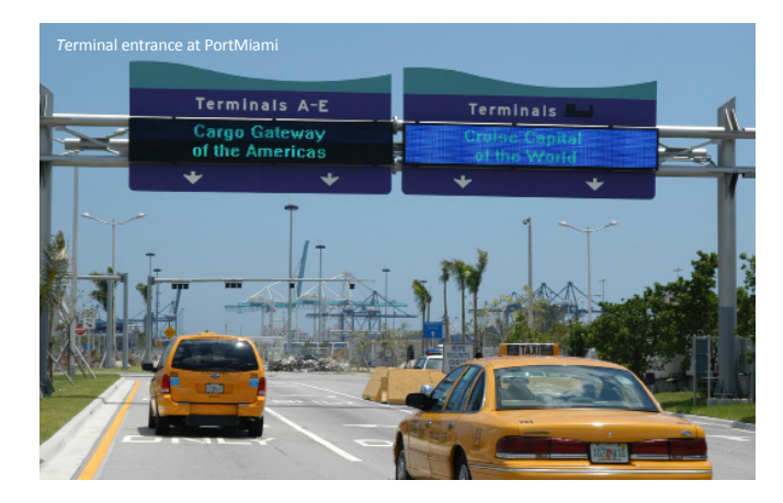
Florida's Cruise Industry Statewide Perspective Florida Department of Transportation Page 16

Based on a 2012 study by Business Research and Economic Advisors for the Cruise Lines International Association, it is estimated that passengers embarking from ports in the United States spend an average of $119.03 per visit. Passengers staying overnight at the home port typically stay 1.1 nights and account for