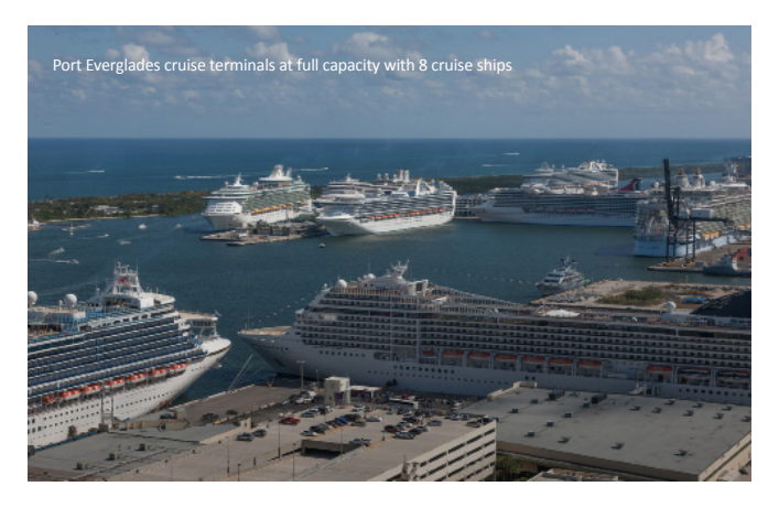
Florida's Cruise Industry Statewide Perspective Florida Department of Transportation Page 12

On the water side, cruise ships approaching from the Atlantic Ocean enter PortMiami using a 500-foot-wide by 2.82-nautical-mile entrance channel through Outer Bar Cut, which is 44 feet deep and travels northwest