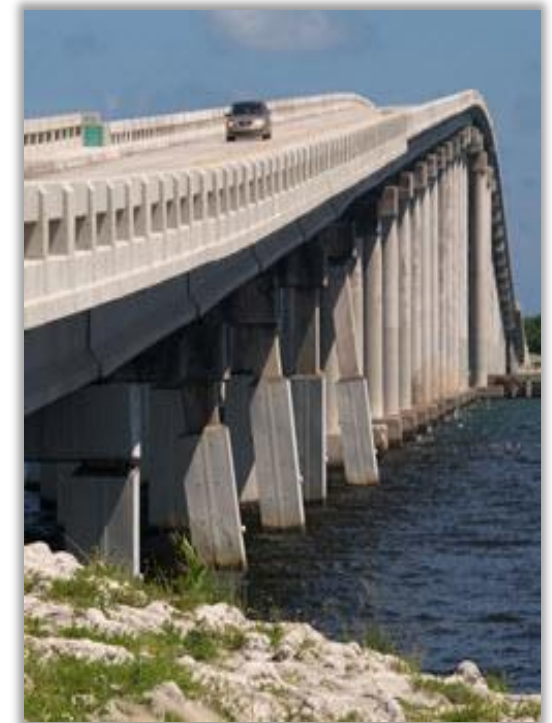
Card Sound Road Bridge – Monroe County SCOP Project District 6