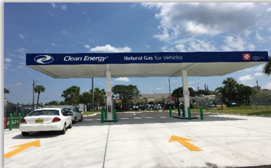
Clean Energy Facilities, Jacksonville Transit Authority TRIP Project, District 2

How to Apply: The regional entity (Metropolitan Planning Organization (MPO), Regional Planning Council (RPC), etc.) submits a priority list of projects to be funded through TRIP to the FDOT district.