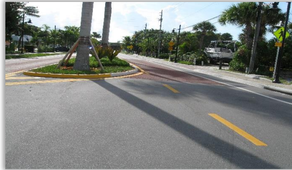
City of Jupiter: A1A Roadway Project– District 4