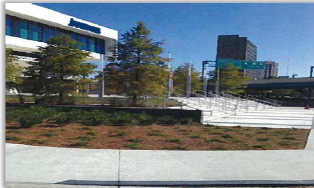
City of Jacksonville: Chamber of Commerce Landscape Improvements – District 2