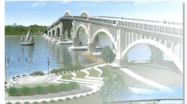
Veterans Memorial Bridge– District 5