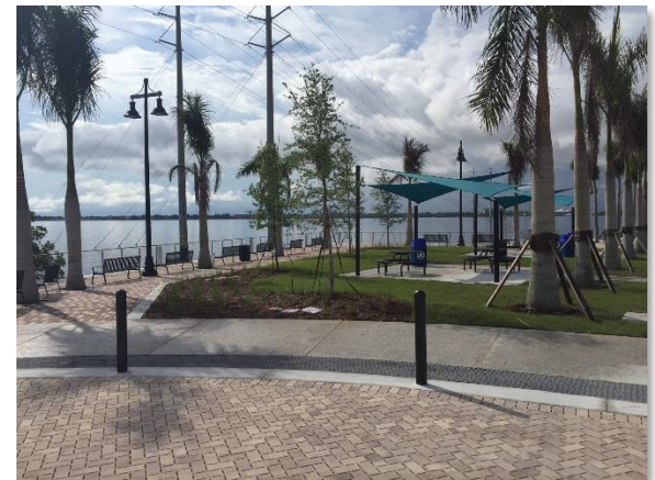
Gateway Harborwalk Phase 1 – District 1