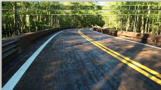
Leon County: Natural Bridge Road – District 3

LAP agencies prioritize and fund local projects (through their respective MPO or governing board) and are then eligible for reimbursement for the services provided to the traveling public through compliance with applicable Federal statutes, rules and regulations.