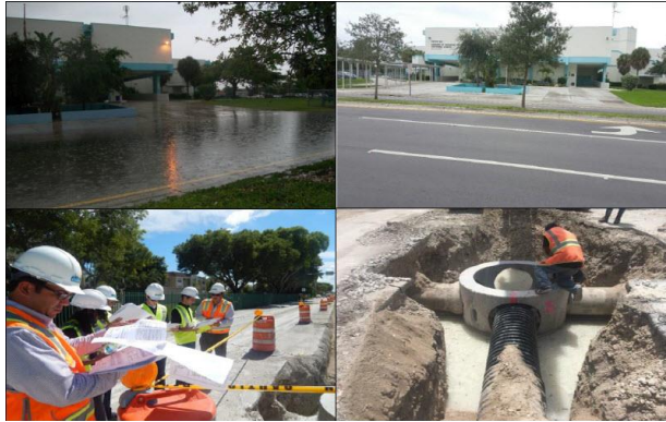
SW 212 Drainage Improvement – District 6