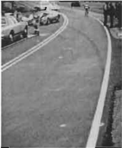
Unsafe edge drop-offs cause crashes.

An edge dropoff of four or more inches is considered unsafe if the roadway edge is at a 90° angle to the shoulder surface. Near vertical edge dropoffs of less than four inches are still considered a safety hazard to the driving public and may cause difficulty