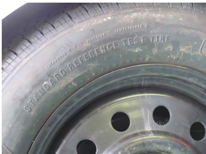
Left: A radial standard reference test tire. These tires are used as a reference for braking action, snow traction, and wear performance, and may also be used for other evaluations, such as pavement roughness and noise.

As part of the research project, researchers also measured wayside noise levels using the statistical pass-