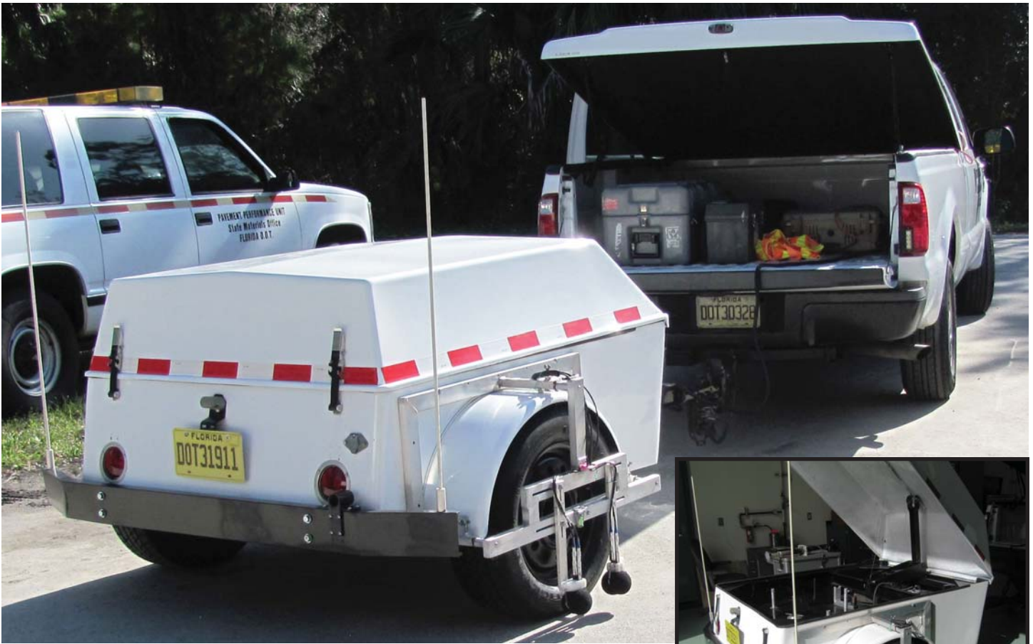
Above: FDOT's on-board sound intensity (OBSI) trailer, designed by researchers at the University of Central Florida, is equipped with phase-matched microphones mounted side-by-side at the leading and trailing edges of the right tire. The microphones collect noise generated from the tire/pavement interface.