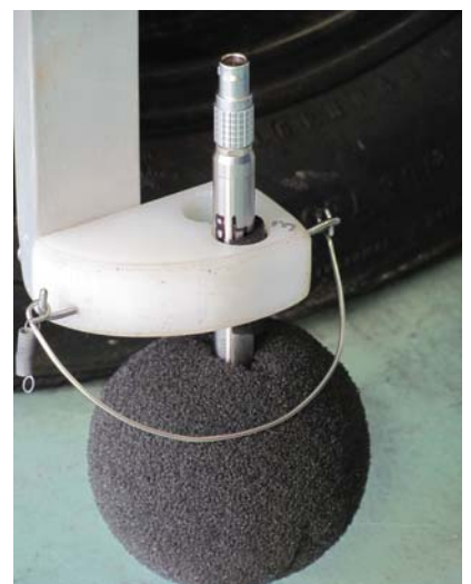
Right: A microphone with wind screen mounted to the FDOT OBSI test trailer.