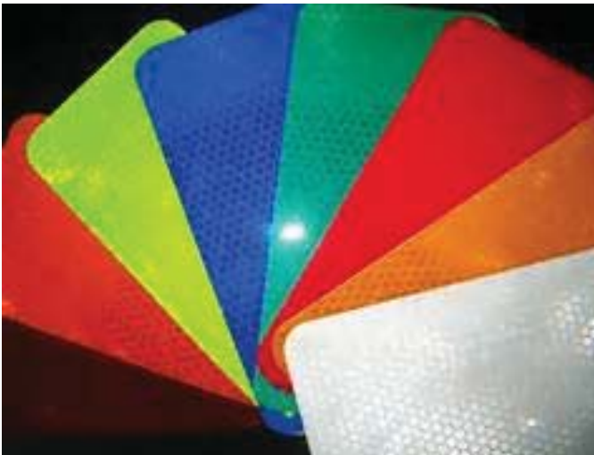
Manufacturers make high intensity prismatic sheeting in a variety of colors and retroreflectivity grades.

Cost of both new and replacement materials is an important aspect of implementing new technology. Therefore, UNF researchers examined costs of upgrading sign lighting and sign sheeting. To evaluate the continued need for sign lighting, the researchers collected field data to assess the conditions of Florida signs in terms of Manual on Uniform Traffic Control Devices (MUTCD) minimum maintained retroreflectivity levels. They developed a luminance computation model to calculate sign luminance under various situations including different sign lighting methods, different roadway geometrics and sign locations, different vehicle headlamps, and different amounts of sign dirt and sign aging. They also compared the calculated luminance of specific signs in specific situations with legibility luminance levels to assess lighting needs required by older drivers.