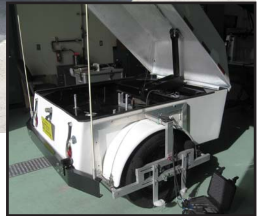
Right: The trailer compartment of the OBSI trailer holds electronic monitoring equipment, the microphone mounting bracket when not in use, and weights to simulate vehicle weight.

abatement levels in the NAC, or if predicted noise levels substantially exceed existing noise levels. While being an effective mitigation measure, noise barriers can be quite costly depending on barrier type, terrain, the presence of utilities, safety issues, bridges and other structures, drainage, or other factors.