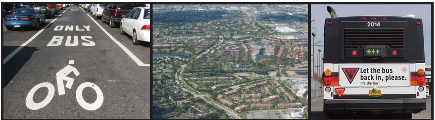
Researchers at the University of South Florida's Center for Urban Transportation Research (CUTR) conducted research on a wide variety of urban transportation issues including transportation demand management, transit planning, and public transit safety.

Since the 1990s, Florida has been host to at least two UTCs. The Transportation Equity Act for the 21 st Century approved funding for two Florida-based centers, the National Center for Transit Research (NCTR) at the University of South Florida (USF) and the Center for Advanced Transportation Systems Simulation (CATSS) at the University of Central Florida (UCF). FDOT contracted match projects with these UTCs and with the two centers awarded to the University of Florida from the mid-2000s: the tier one Center for Multimodal Solutions for Congestion Mitigation (CMS) and its successor, a regional UTC, the Southeastern Transportation Research, Innovation, Development and Education Center (STRIDE).