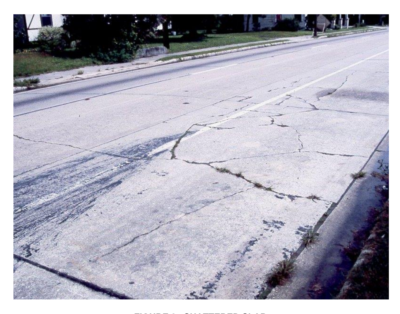
FIGURE 8. SHATTERED SLAB