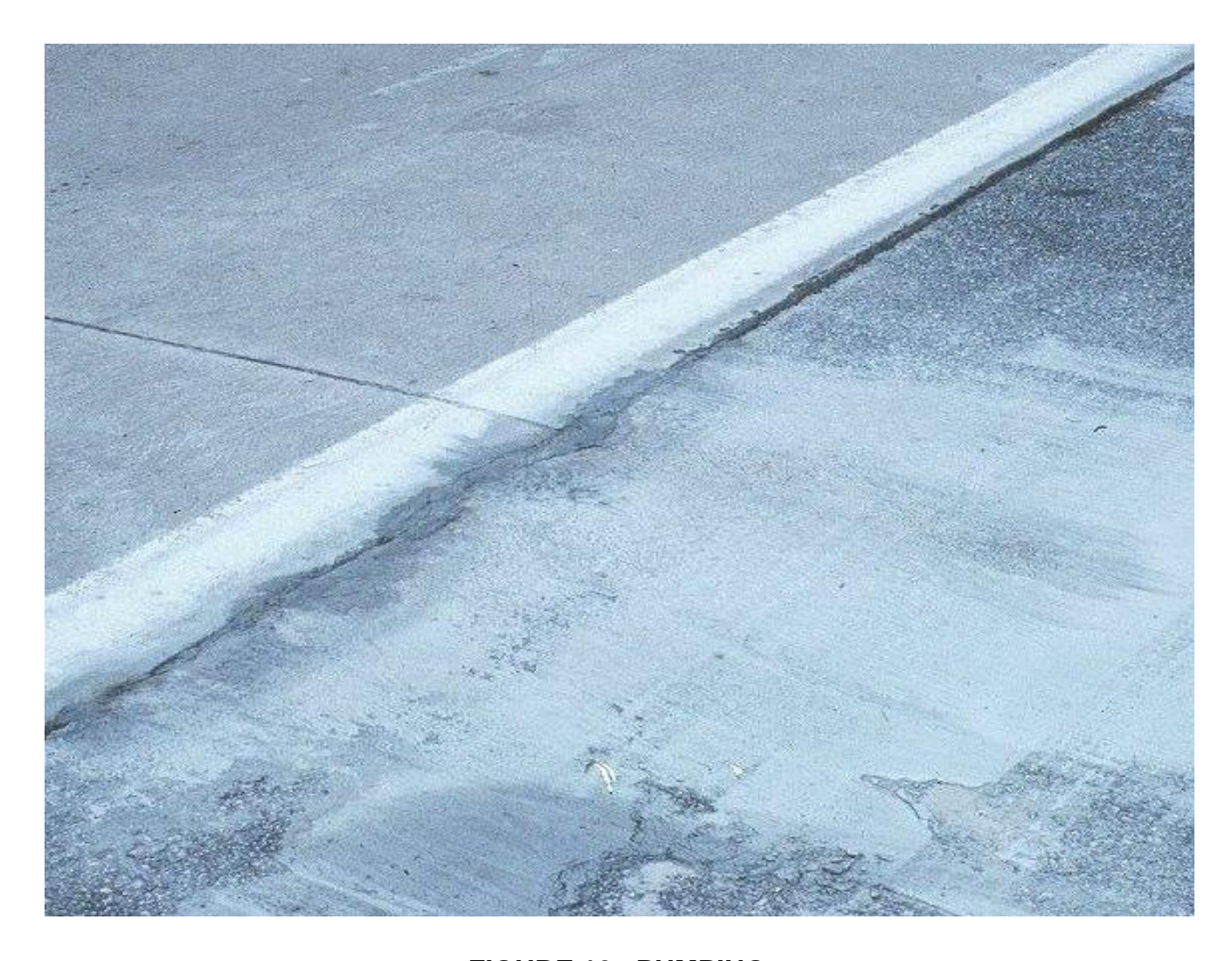
FIGURE 10. PUMPING