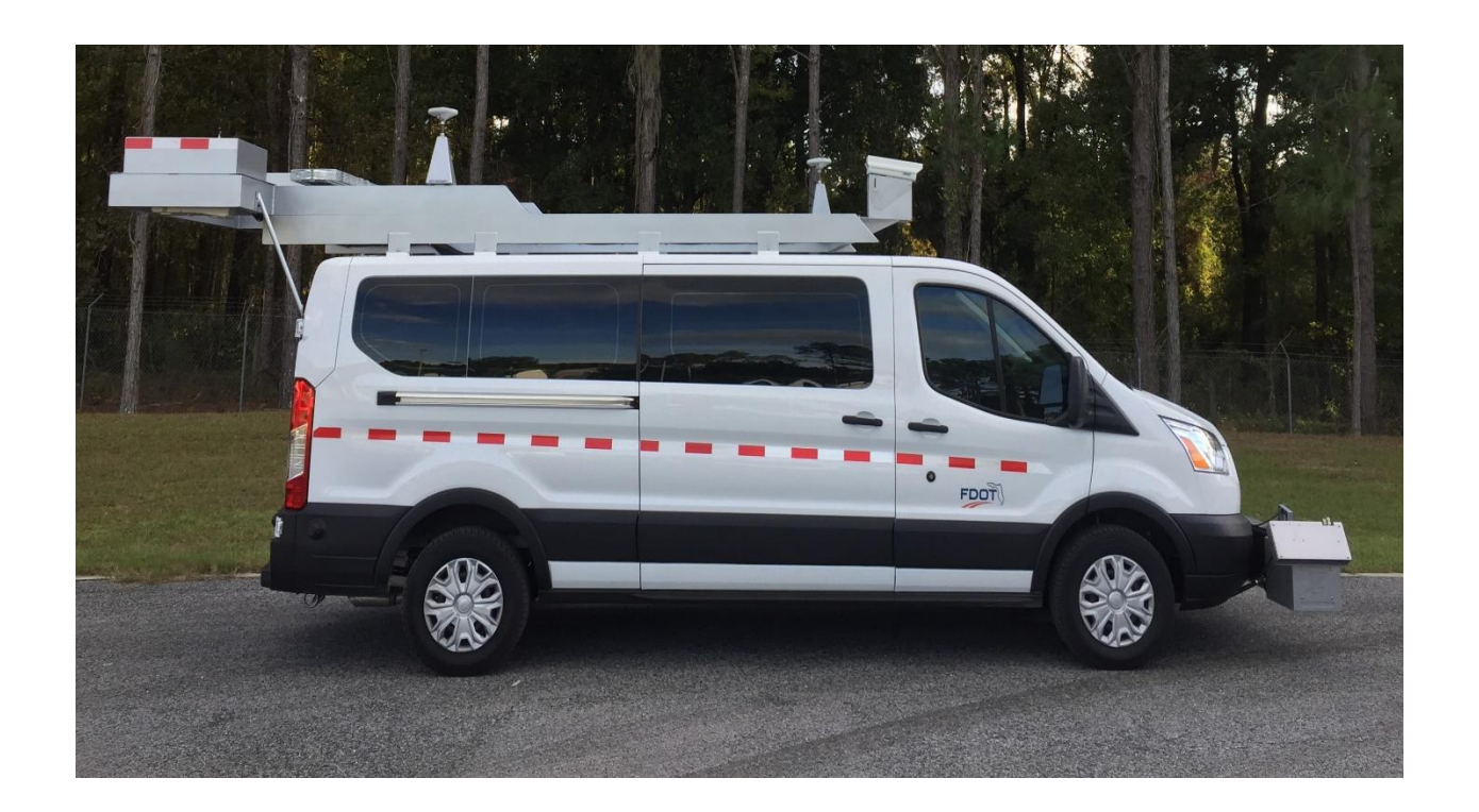
FIGURE 1. LCMS w/ INERTIAL PROFILER