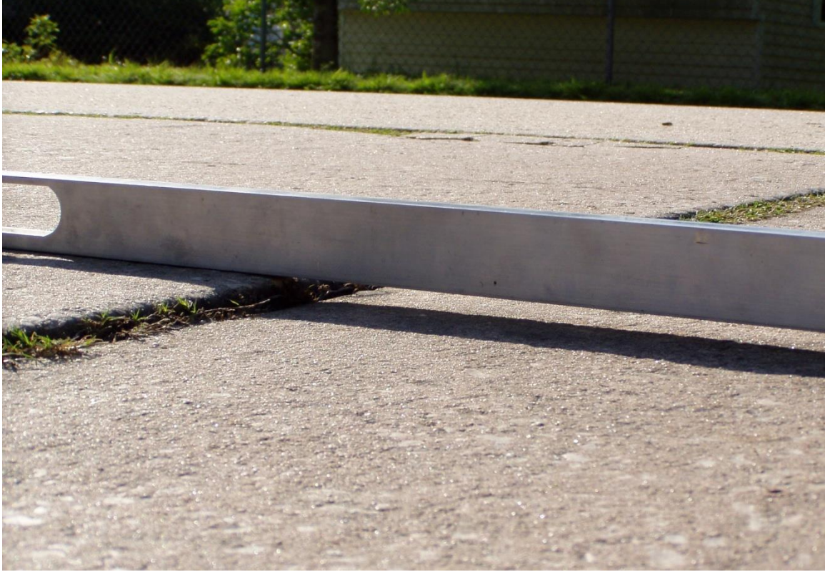
FIGURE 9. FAULTING