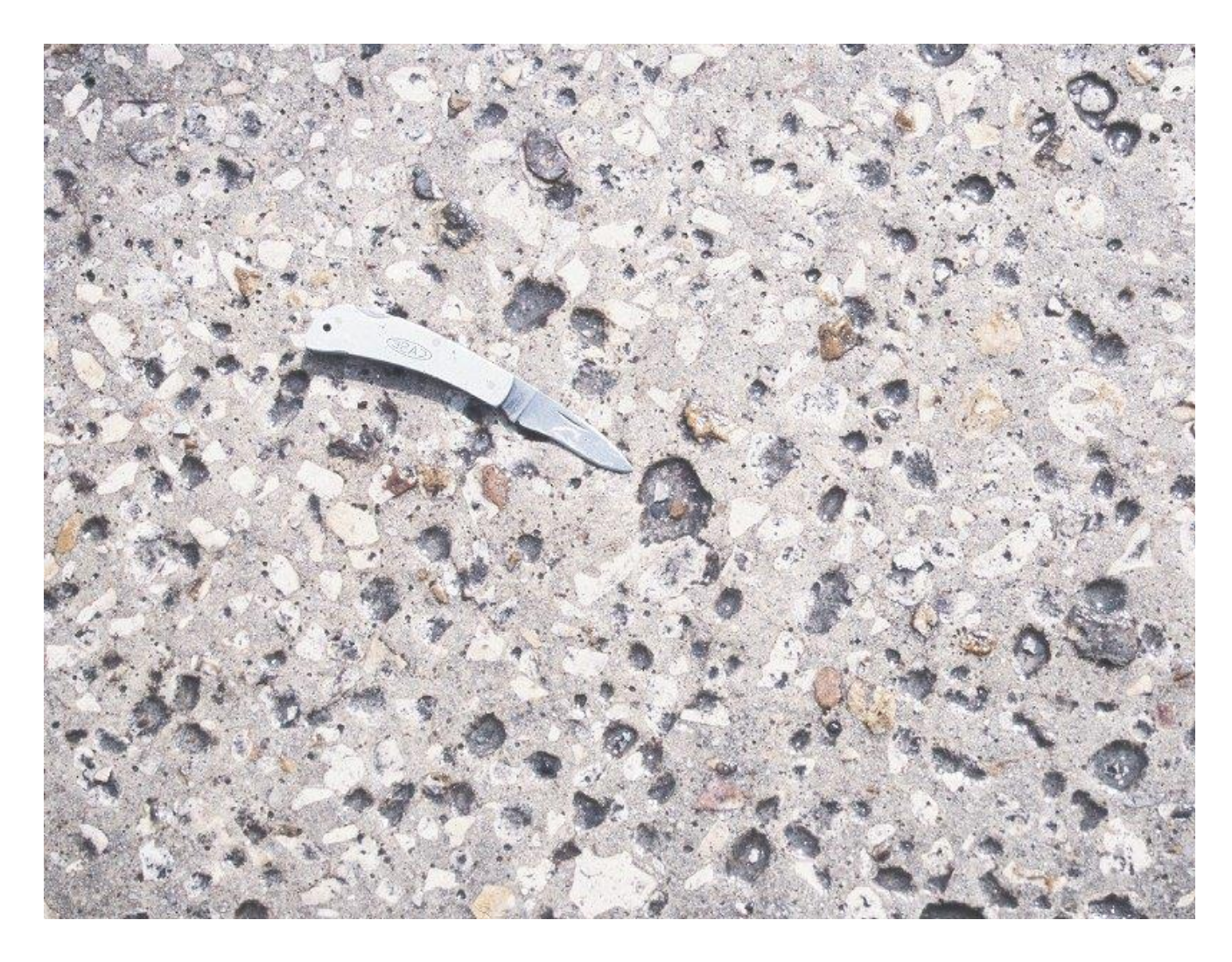
FIGURE 2. SURFACE DETERIORATION