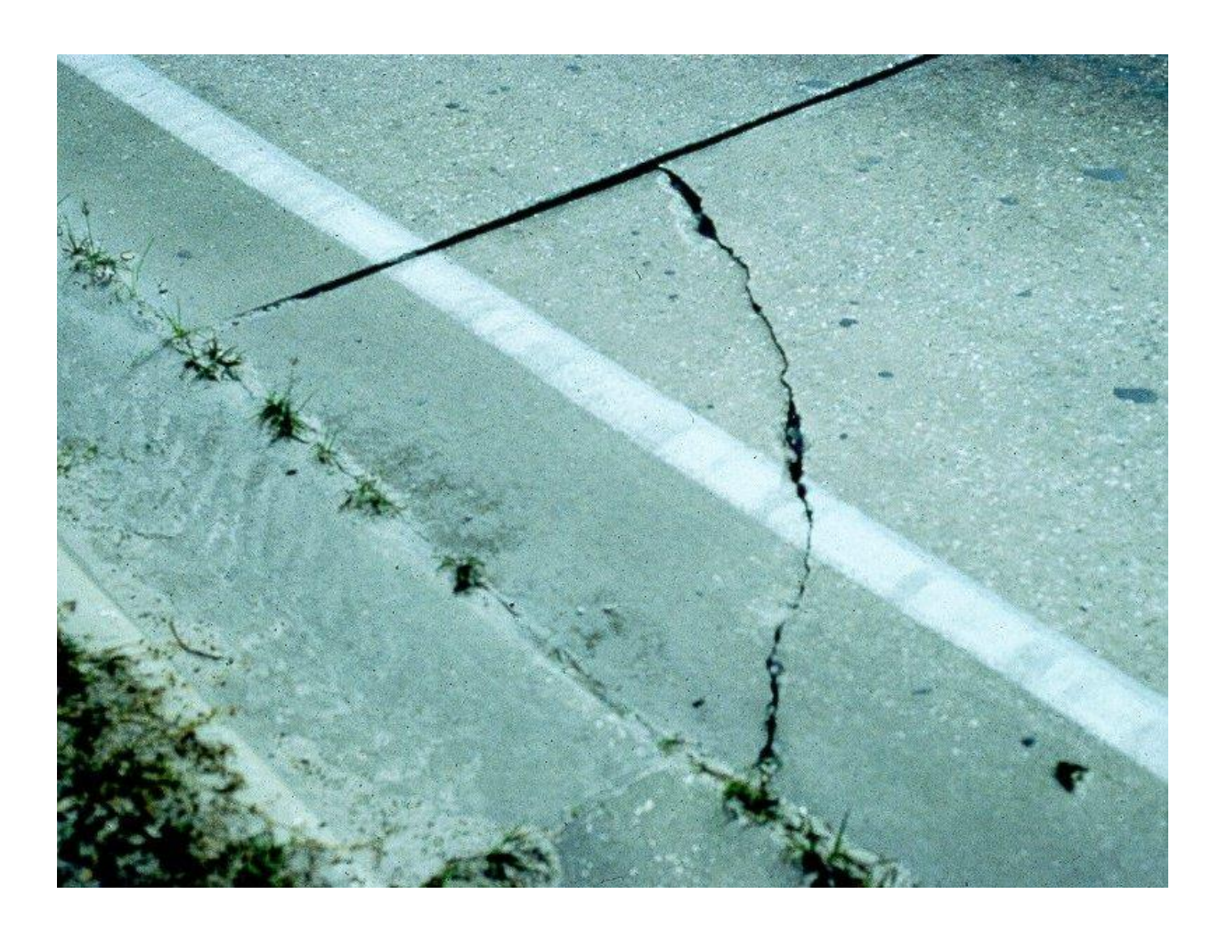
FIGURE 7. CORNER CRACKING