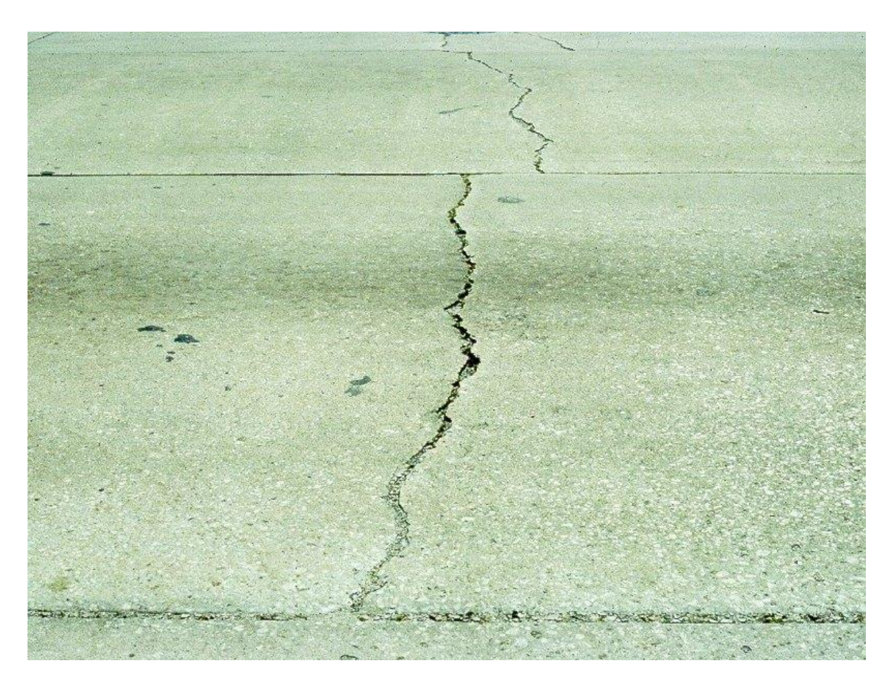
FIGURE 5. TRANSVERSE CRACKING