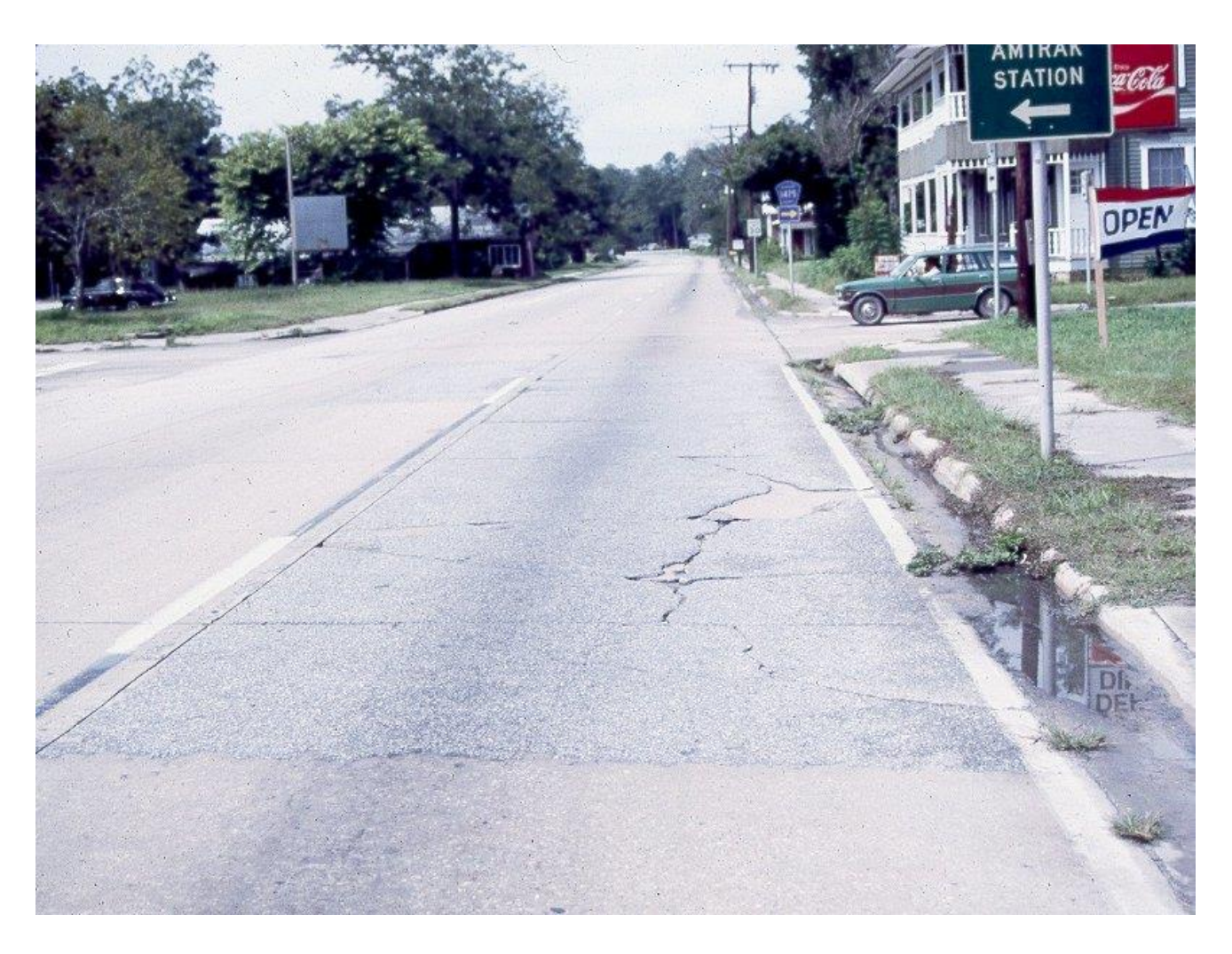
FIGURE 4. PATCHING