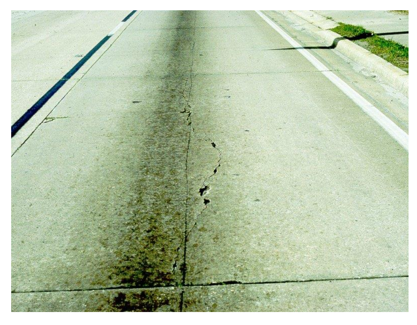
FIGURE 6. LONGITUDINAL CRACKING