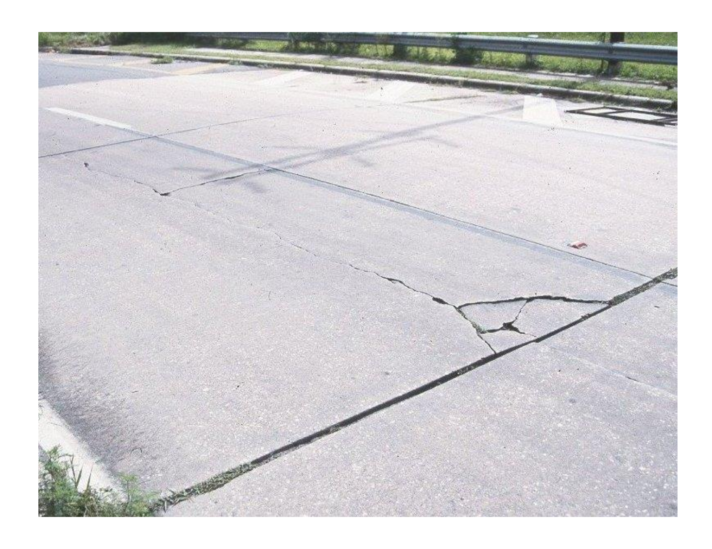
FIGURE 11. JOINT CONDITION