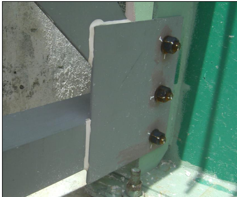
A Caulked Field Connection

The pattern to be followed in applying the paint should make it possible to get a uniform thickness not less than the thickness specified. There must be some overlapping at the edges of strips covered on successive strokes of the spray gun. The spray gun should be held at right angles to the surface being painted and at the correct distance away from it. All small cracks and cavities, such as those in back of crimped stiffeners and ground splice plates, which were not sealed watertight by the first coats of paint, must be caulked with an approved caulking compound. This caulking compound must be dry before the next coat of paint is applied.