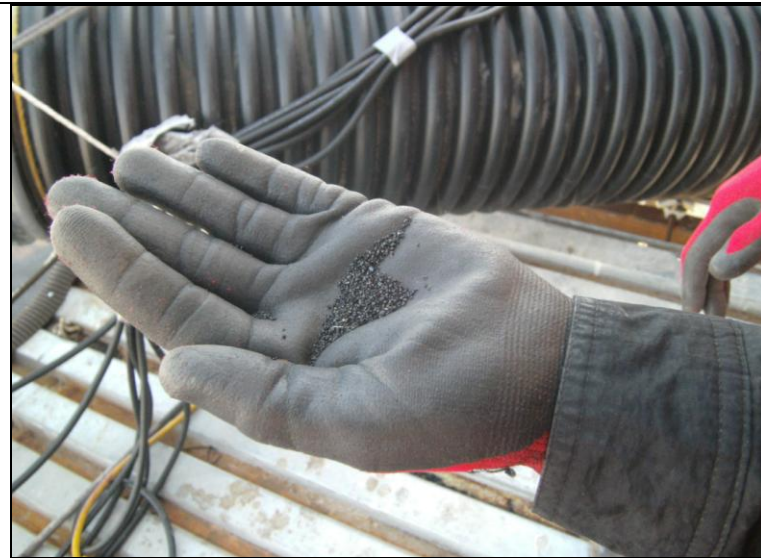
Abrasive Media Used for Surface at a Bridge Repainting Project