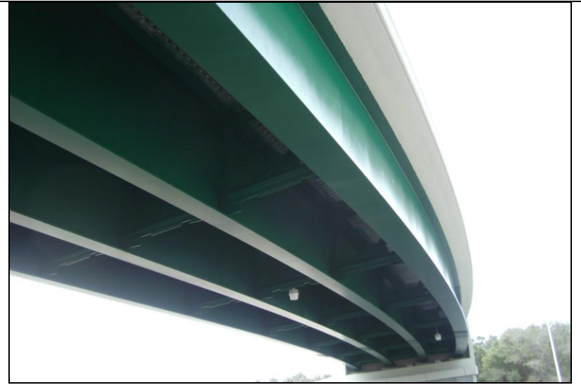
A Freshly Painted Bridge Superstructure – note the absence of overspray on the deck overhang and SIP forms

Before the application of other coats, make sure any dust, dirt, oil, grease or other foreign materials are removed from the surface of the prime coat to insure the next coat will adhere properly. Pay particular attention to horizontal surfaces or surfaces that can collect debris including airborne material generated by dusty construction operations. These surfaces are usually not visible from the ground and are easily missed during the cleaning process.