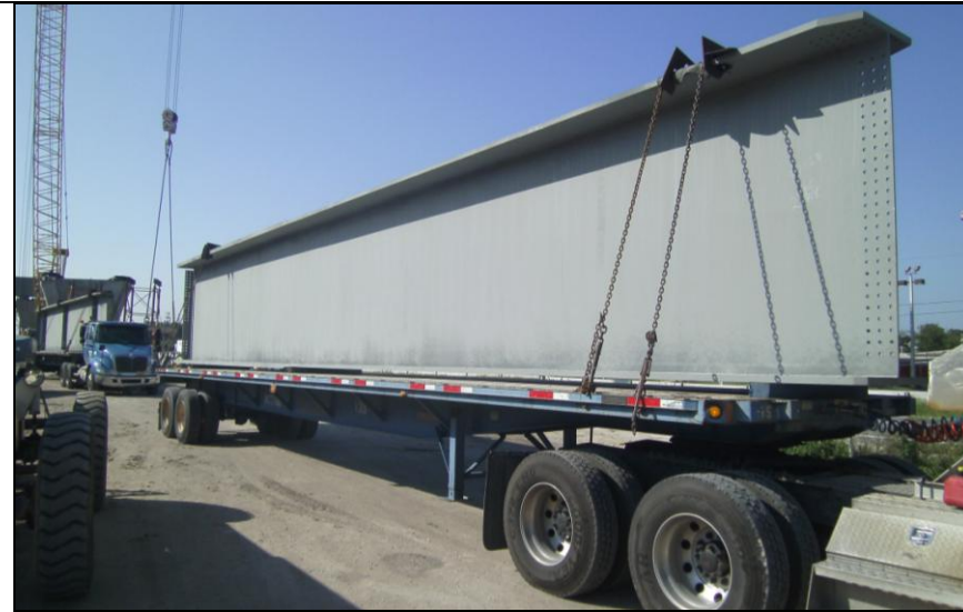
A Primed Plate Girder Arriving from the Fabrication Facility