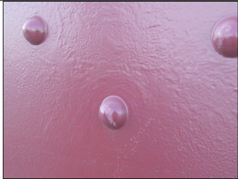
Note the Visibility of the Stripe Coating, Even After Application of the Final Top Coat