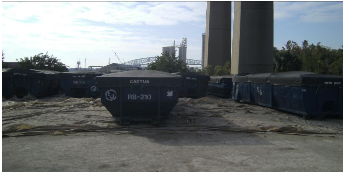
Spent Abrasive Media and Removed Paint Storage

Concerns associated with painting operations include worker safety, air and water pollution, control of overspray and disposal of contaminated waste. These concerns can have a major impact on public safety and so you must be familiar with all the specifications and regulations that govern these issues. You must bring violations to the attention of the Project Administrator immediately since they can result in serious injury or death of project personnel or the public.