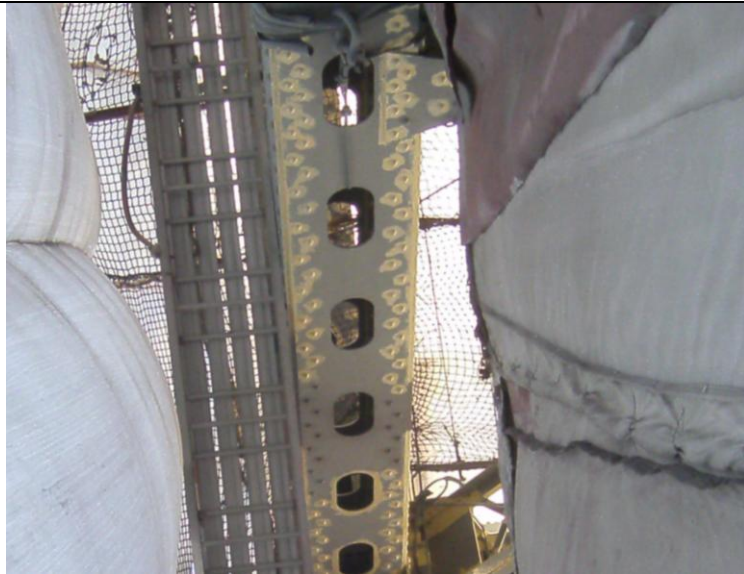
Hand Painted Stripe Coating On Existing Bridge Rivets

Thorough mixing of the paint before it is applied is essential. A mechanical mixer should be used for stirring the paint when required.