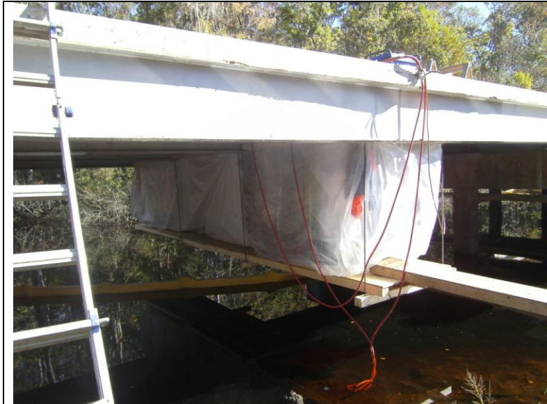
A Contained Environment for a Small Bridge

Inadequate protection systems and violations of worker safety procedures must be reported to the Project Administrator immediately.