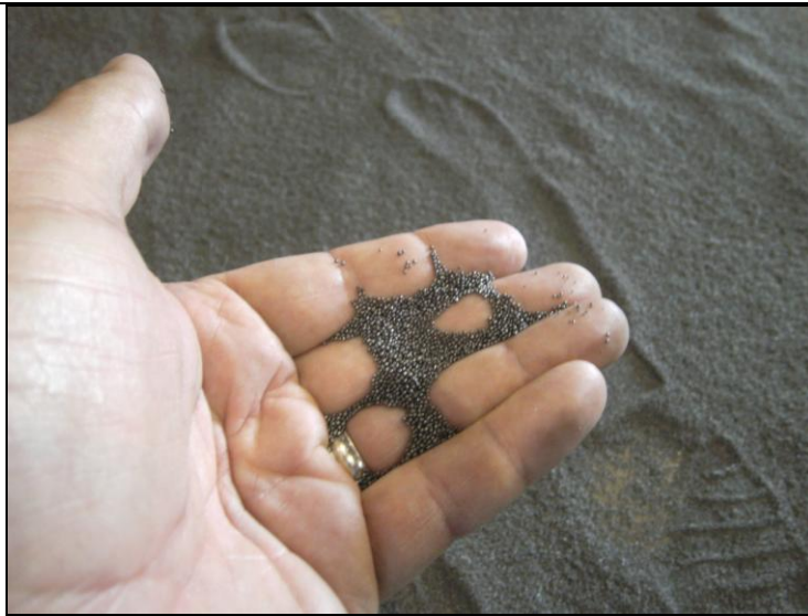
Steel Shot Media Used for Surface Preparation at a Fabrication Facility

If the project is a first time paint job, the steel members will be delivered to the construction site with the prime coat applied. When steel members arrive at the site, they need to be inspected to see if there was damage of the prime coat during shipment. Damaged places must be touched up prior to the application of any other coats. You must verify that touch-up paint is the same paint that was used in the shop.