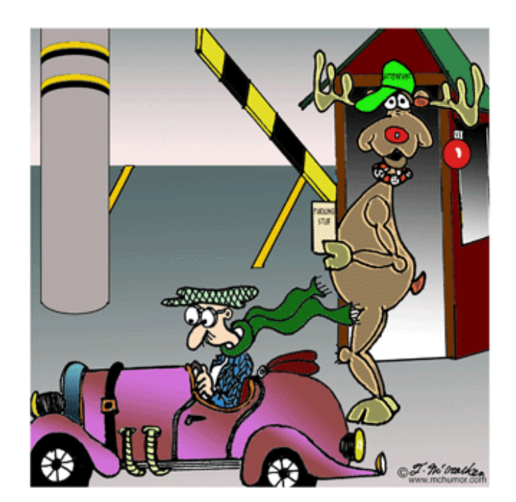
"WHAT PIP YOU THINK I PIP THE REST OF THE YEAR?"