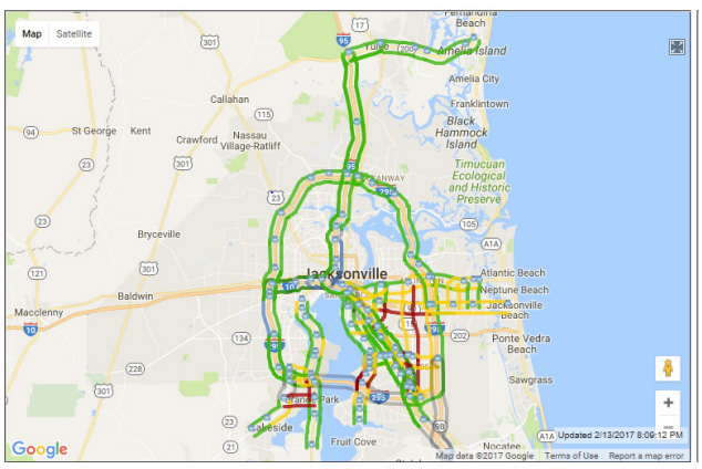
BlueTOAD map of Greater Jacksonville area (source: FDOT)

District Two launched their Regional Arterial Management Program (RAMP) in November 2016 with the first roll-out consisting of 10 corridors in the Jacksonville area. When the roll-out is complete, 32 Routes of Significance will be covered on Northeast Florida's most traveled arterial roadways. District Two's arterial coverage will branch out to cover Jacksonville, Gainesville and parts of St Johns, Clay and Nassau Counties. The vision is to be the leader in Arterial Management and traveler information dissemination in the United States. RAMP will set the benchmark for travel time reliability with the efficient movement of motorists, goods and services throughout the First Coast.