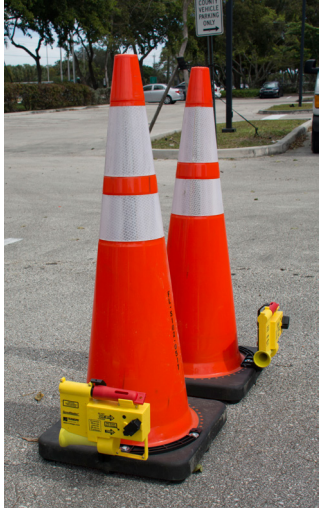
Two SonoBlaster® alarms attached to safety cones.