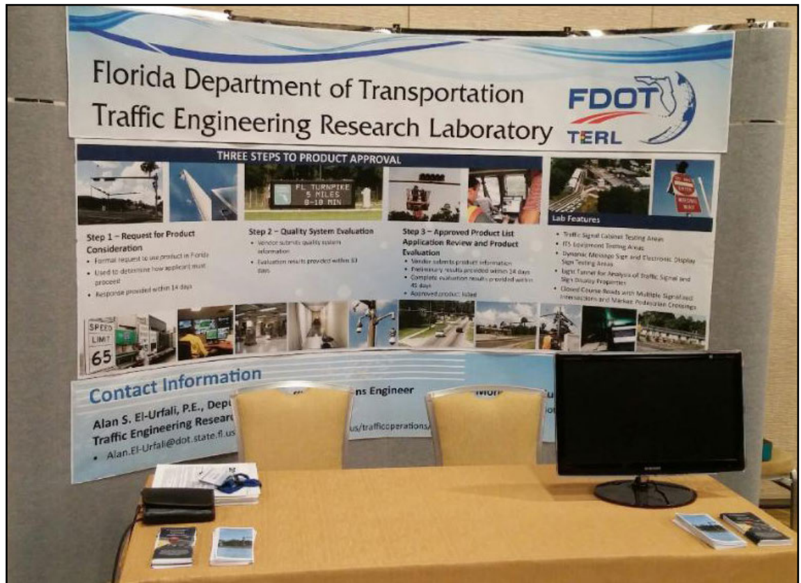
FDOT's TERL exhibit at the I 3 Transportation Showcase.