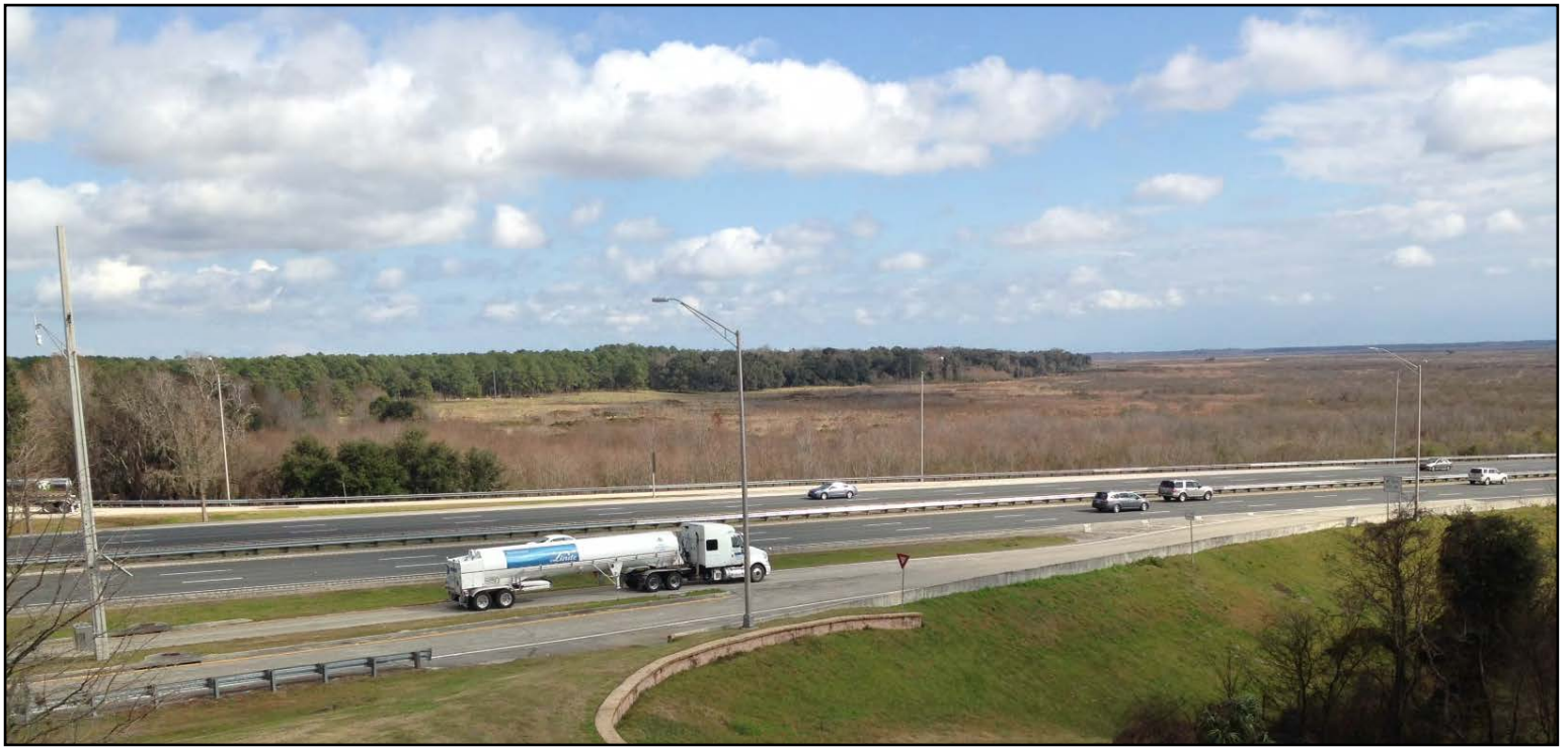
I-75 in the Paynes Prairie area.

On the afternoon of January 21 st , FDOT's District Two office held a groundbreaking ceremony at the I-75 southbound rest area near the northern limits of this project. State Secretary Prasad, District Two Secretary Evans, and Representative Perry gave inspirational speeches on the reasons for and goals of this deployment. The ITS staff provided table top displays of all the equipment being deployed with the exception of a dynamic message sign. Instead of a 30 by 8 foot sign, we showed them the inner workings of this device. We also incorporated a temporary installation of a thermal imaging/CCTV camera at the rest area to display the features of this technology. All attendees were allowed to play with the camera to get a feel for the features of this device.