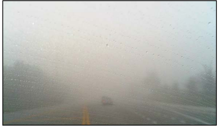
Bad weather can result in poor visibility on Florida's roadways.

FDOT will modify SunGuide software to support the National Transportation Communications for Intelligent Transportation Systems Protocol (NTCIP) 1204 version 3 released in October 2009. This is the newer version used to communicate with RWIS devices. Originally, SunGuide software only supported NTCIP 1204 version 2.18 released in April 2004. Modifying the software to support NTCIP 1204 version 3 will allow SunGuide software to communicate with the fog sensors used in the Paynes Prairie area and any other RWIS device using this protocol. This will also afford more choices for RWIS deployments, including newer devices available on the market.