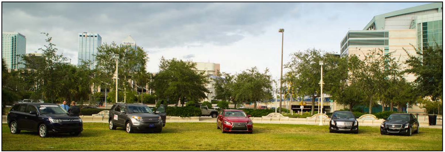
Local Tampa auto dealers showcased vehicles that currently offer automation.