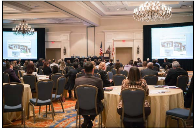
The first annual Florida Automated Vehicles Summit.

The Florida Engineering Society, Florida Department of Transportation (FDOT), University of South Florida's Center for Urban Transportation Research, and the Tampa Hillsborough Expressway Authority held the first annual Florida Automated Vehicles Summit in Tampa on November 14-15, 2013. The partnership was formed to bring transportation professionals, academics, and private industry up to speed on the cutting-edge trends regarding autonomous vehicles and connected vehicles. Discussions were held to help these stakeholders begin to address the challenges and opportunities that this technology will present on public roadways in Florida. Autonomous vehicle technology may offer substantial improvements to safety and congestion management, furthering FDOT's vision to serve "the people of Florida by delivering a transportation system that is fatality and congestion free."