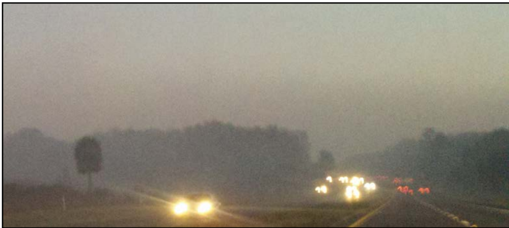
Smokey conditions near Paynes Prairie on U.S. 441.