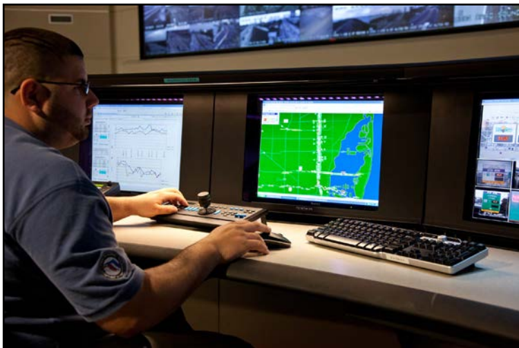
Operator at the SunGuide Regional Transportation Management Center.

Upon completing the analysis, the District disconnected leased telephone based communications circuits at eight strategic locations along the highway. It replaced these circuits with wireless communications devices to maintain the system reliability and avoid dependency on a third party utility. This reconfiguration is allowing the District to save approximately $49,000 annually resulting in a 61 percent reduction in utility costs. The ultimate goal is to eliminate leased circuits. This improvement will allow the District to invest these savings on other projects to continue its goal to expand and enhance the ITS program in southeast Florida.