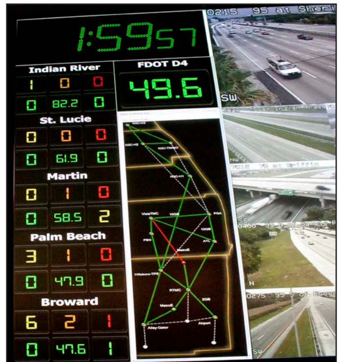
District Four key data video wall display.