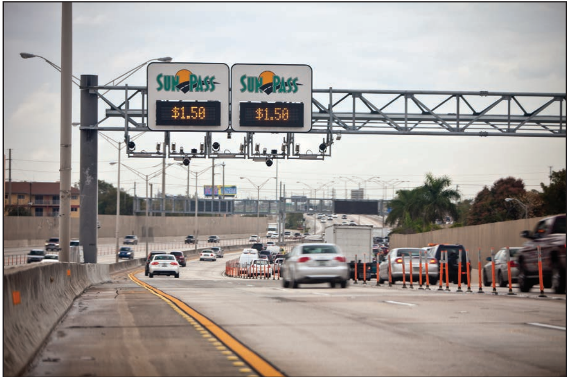
District Six 95 Express

The District's third and final presentation was about the cultural shift the industry is experiencing due to the proliferation of managed lanes projects and the need for increased customer service. The program's Public Information