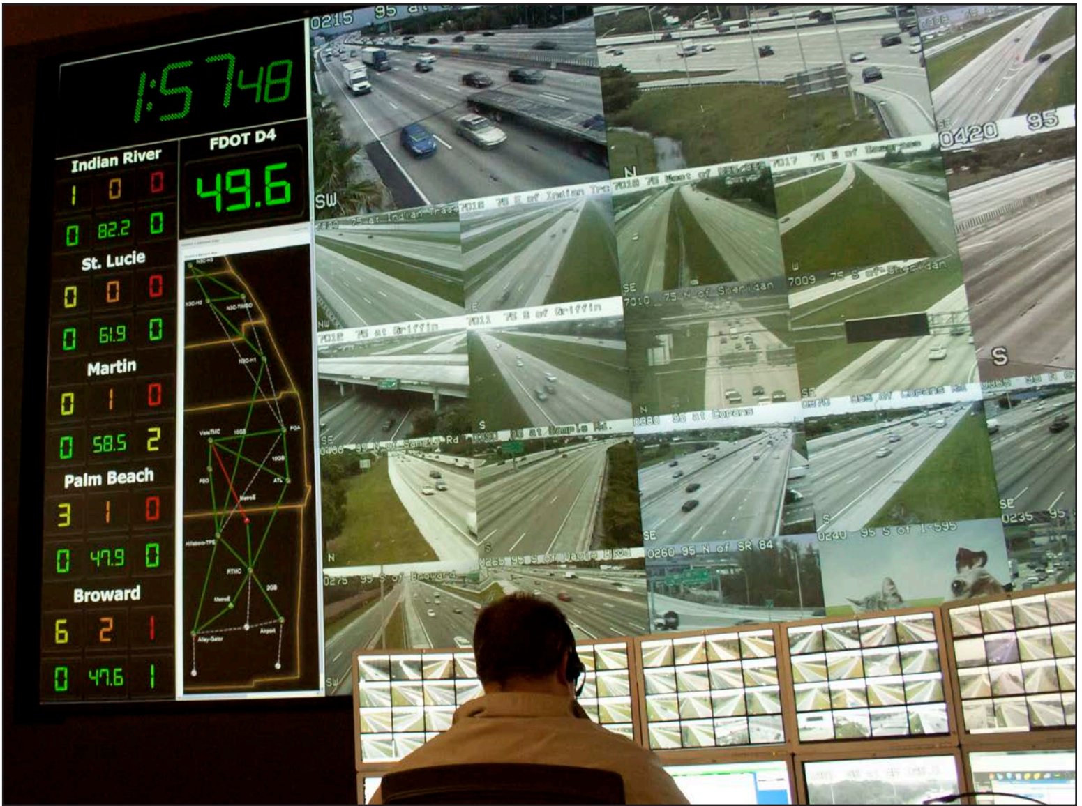
Displaying the “big picture” information.