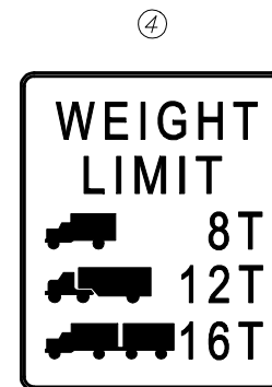
R12-5 (30" X 36")