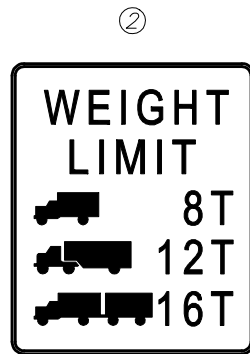
R12-5 (30" X 36")