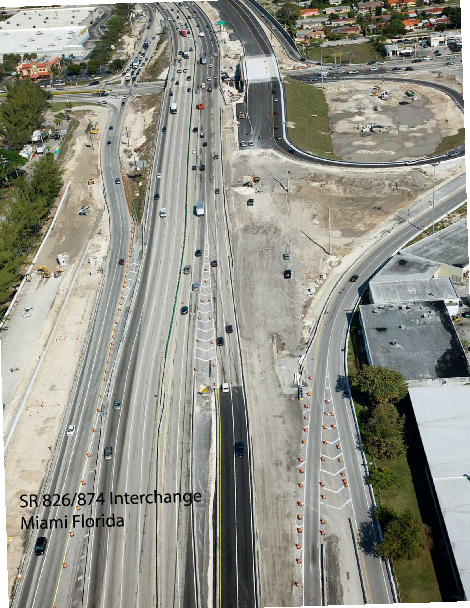
SR 826/874 Interchange Miami Florida